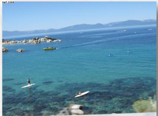
Scenic Point Of Lake Tahoe