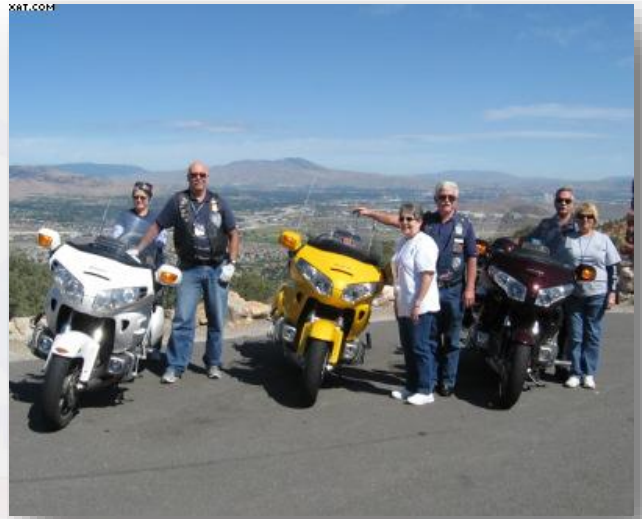
Mountains Outside Reno

Some photos of the Reno Convention experience: