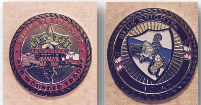
Texas Honor Ride 10 th Anniversary Challenge Coin

In tribute of the club's involvement, the Texas Honor Ride's 10 th Anniversary Challenge Coin has the symbol of the Blue Knights on one side.