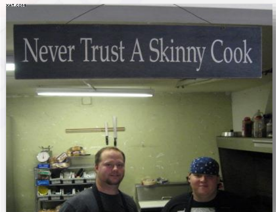
Words to Remember