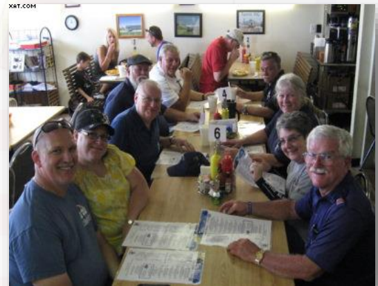
Hungry Group Blue Knights

The fun of this place is watching the small aircraft fly in to land while watching the traffic try to get out of the way while crossing the path near the end of the runway. The planes come in about 10 feet off the ground over the road where the traffic enters to get to the café and some of the hangars.