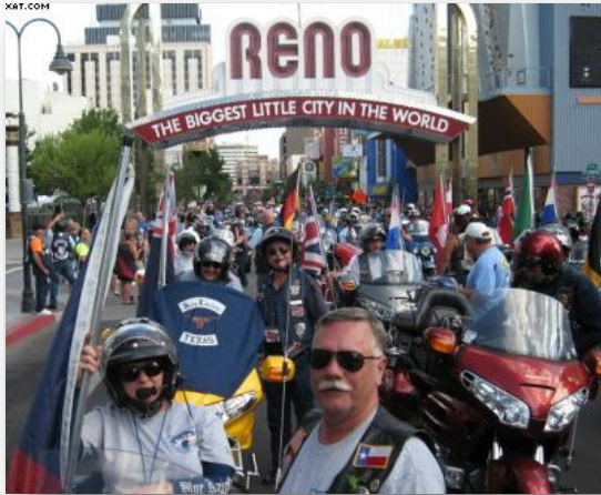
Downtown Parade Finish Line