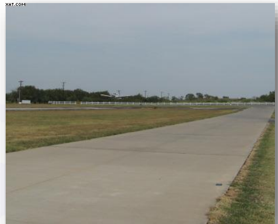
Plane Landing to Left Above Fence

Upon our return, part of the “healthy group” took a lunch ride to a small, private airport near Denton to the Blue Hangar Café. It’s not a fancy place but it is an interesting place. They have some photos on the walls of some memorable events in aviation history.