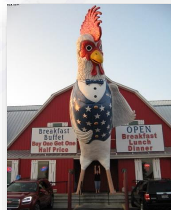
Great Chick Fried Steak!