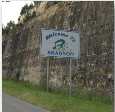
Made Destination Easy