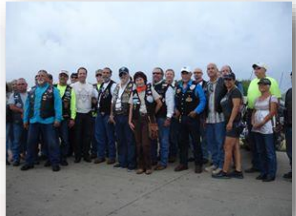
Participating Members TX-IV, TX-XII, TX-XXV

We were able to present over $ 500.00 worth of backpacks and other school supplies to needy children. In addition, Chapter IV came in on a personal challenge from our former Chapter president and collected an additional $ 1,000.00 for Family Service. This donation will be used to purchase school uniforms for needful families. This was one of those "feel good" adventures that we all enjoy.