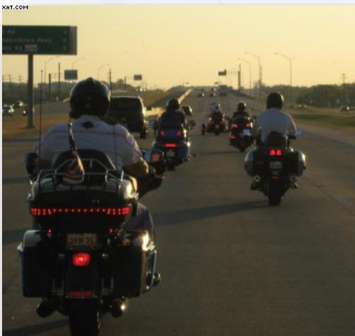
Headed Out Dallas Tollway