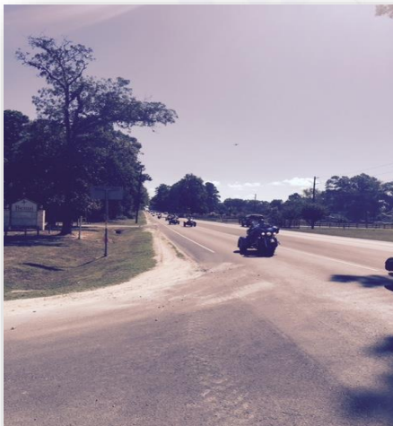
Rider Approaching Lake Conroe

The Texas Honor Ride has two major rides each year, the Houston area ride in September and the November ride to Fort Sam Houston. Founded in 2005, The Texas Honor Ride has raised 1.3 million dollars for wounded troops and their families at Brooke Army Medical Center (BAMC) at Fort Sam Houston TX.