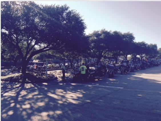
Biker Assembly West Conroe Baptist Church

After assembly and signup at West Conroe Baptist Church in Conroe, the riders departed just after 10:00 am. They were then escorted for a 50 mile ride through the hilly country roads forty miles north of Houston, including the Lake Conroe area. After finishing the ride, the riders were treated to a barbeque and concert. Later that afternoon they participated in both live and silent auctions and vendor sales.