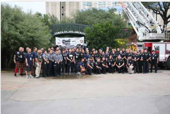
Participating Police Officers