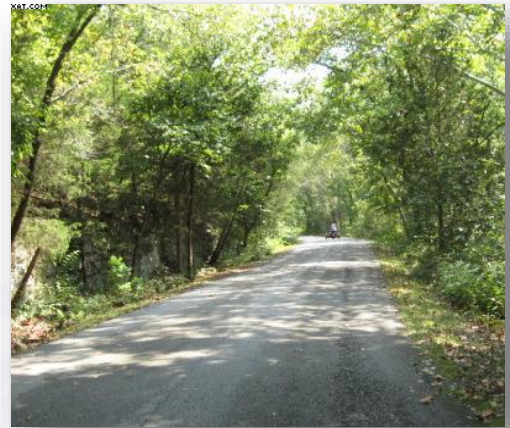
Scenic Ride Near Table Rock Lake

Only problem this time was that it was Labor Day, a holiday, and nothing was open. Thanks to friends and family, we were able to get a truck and trailer to haul the crippled steed back to DFW for a proper tire replacement.