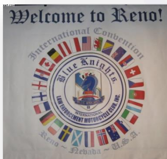
Welcome Banner Registration