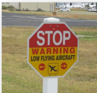
They Do Mean It!