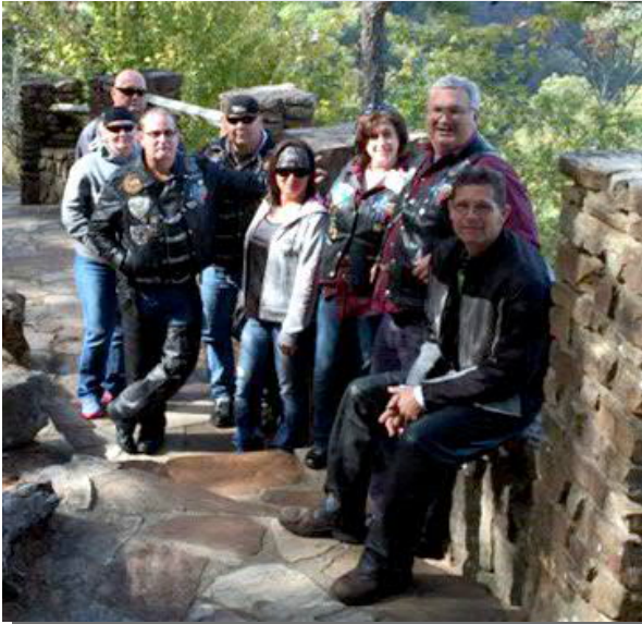
Blue Knights Texas XXII at Hot Springs

visiting Blanchard Springs Caverns. We tried this in 2014 but had made our hotel reservations too far away. I think Russellville will get it just right.