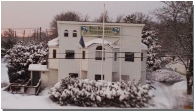
Blue Knights International Headquarters, Bangor, Maine

B lue Knights International [www.blueknights.org] has a fundraiser to rennovate or relocate the HQ building in Bangor, Maine. The fundraiser will end July 1, 2017. Go online and read about it. A "Building Donation Fund Form" follows this Newsletter.