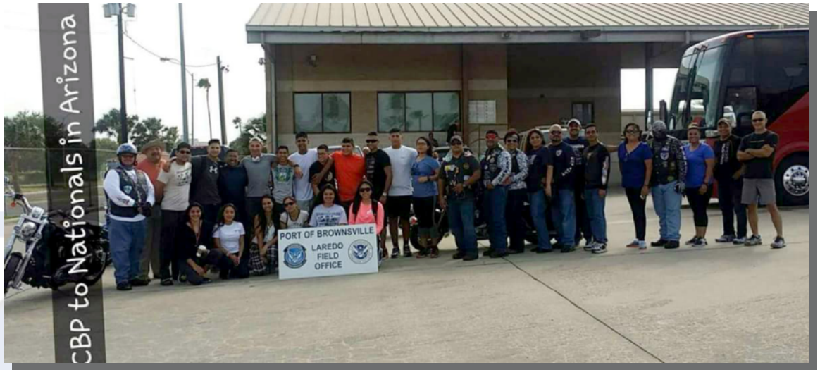
Blue Knights Texas II Escorted US Customs Explorers to Flagstaff, AZ

As we all know this club is about family. Texas II spent the first weekend of September at South Padre Island. Members and family had dinner at