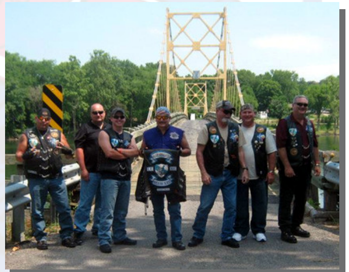
One Lane Bridge in MO