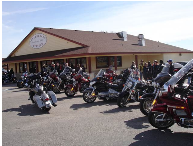
Meeting up on a chilly morning